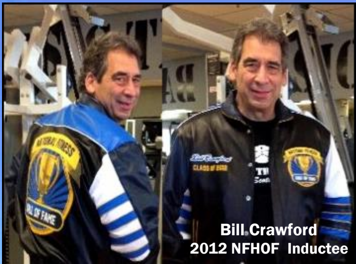
Bill Crawford 2012 NFHOF Inductee